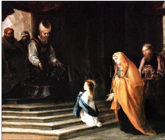
Presentation of the Blessed Virgin Mary Tuesday, November 21