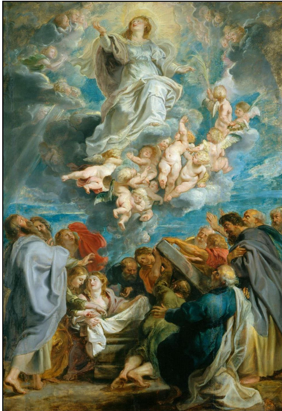
Solemnity of the Assumption of Mary Tuesday, August 15

NINETEENTH SUNDAY IN ORDINARY TIME AUGUST 13, 2017