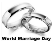
World Marriage Day

THANK YOU THE SOCIETY OF ST. VINCENT DE PAUL OLMC CONFERENCE is grateful to the parishioners of St. John Vianney Chapel and Our Lady of Mount Carmel Church for their contributions to aid the needy which enabled us to assist 67 people in December.